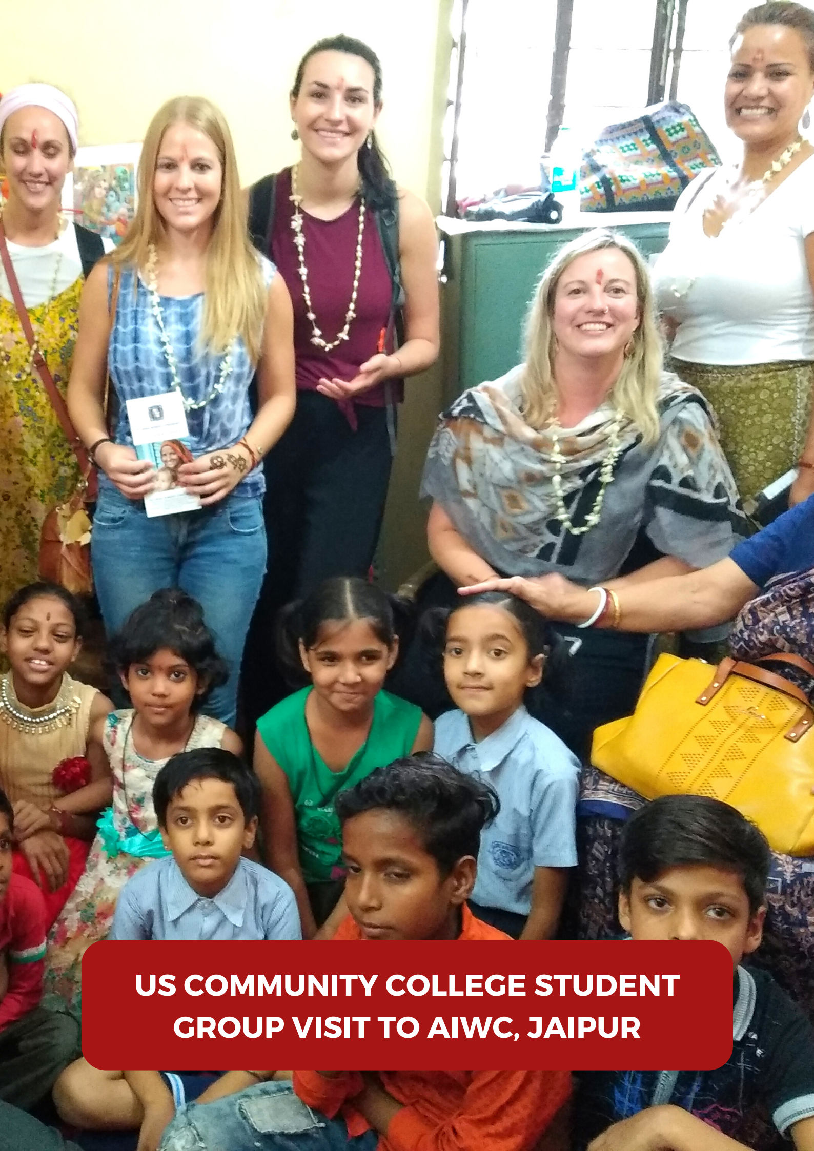
US COMMUNITY COLLEGE STUDENT GROUP VISIT TO AIWC, JAIPUR